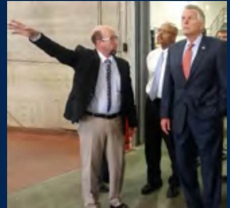
Governor McAuliffe Touring Oran Safety Glass (OSG) plant with David Yogev of OSG (2017)

Dragas Center for Economic Analysis and Policy (2020) and Bureau of Economic Analysis (2019). Converted to 2019 dollars using the Consumer Price Index for All Urban Consumers. The estimates represent the cumulative impact of employment and investment for OSG's operations in the Commonwealth (citation from Page 13 Figure 2 of the March 2020 report)